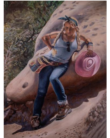
"Self-Portrait, Punchbowl" , Oil on linen, 36x24, 2021

Honor Recognition Award from California Legislature